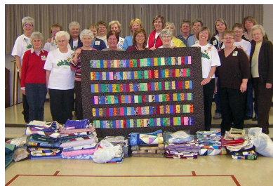
The very productive Calgary Branch

With more branches being opened in communities across Canada, the number of quilts made and distributed within that community will also increase. And the funds that would have been spent on mailing the quilts